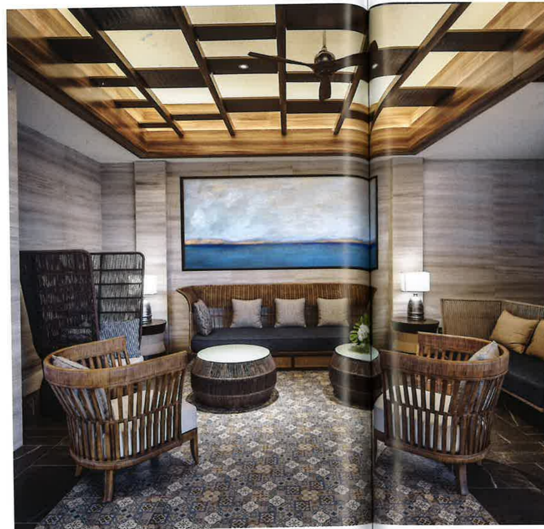
Lobby lounge area