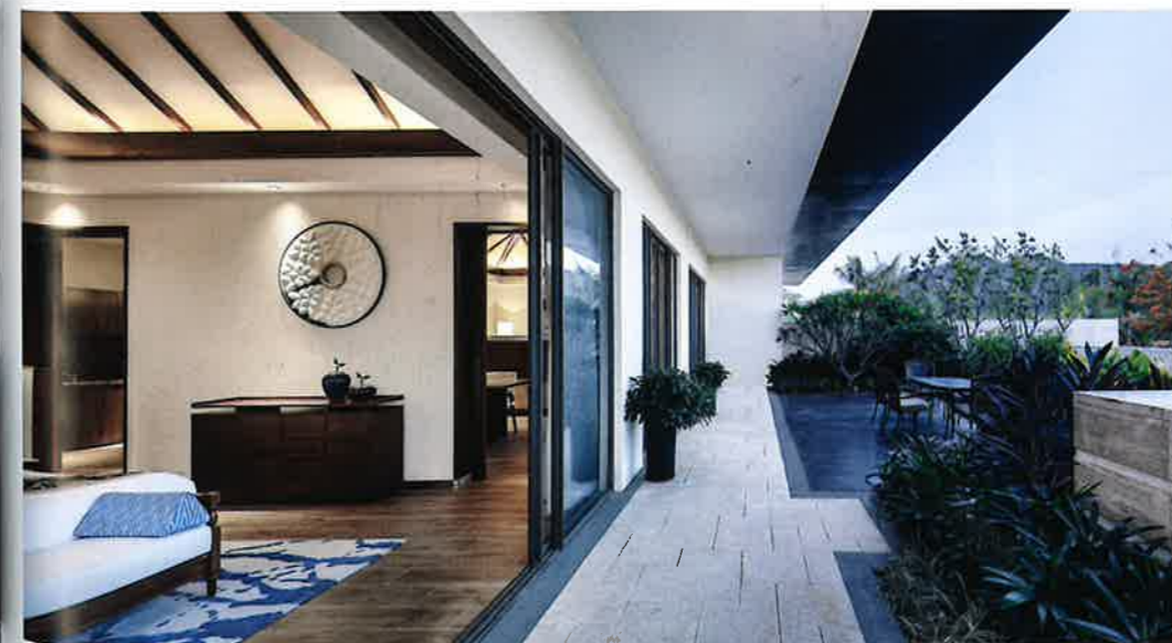
Guest suite outdoor view