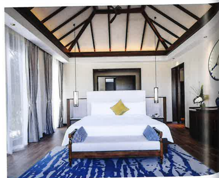
Big guest suite bedroom